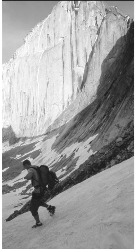
Josh Wharton stopping the clock atop the first free ascent of the Original Route on Mt. Proboscis (shown on the right), which was also the first one-day ascent of the face.